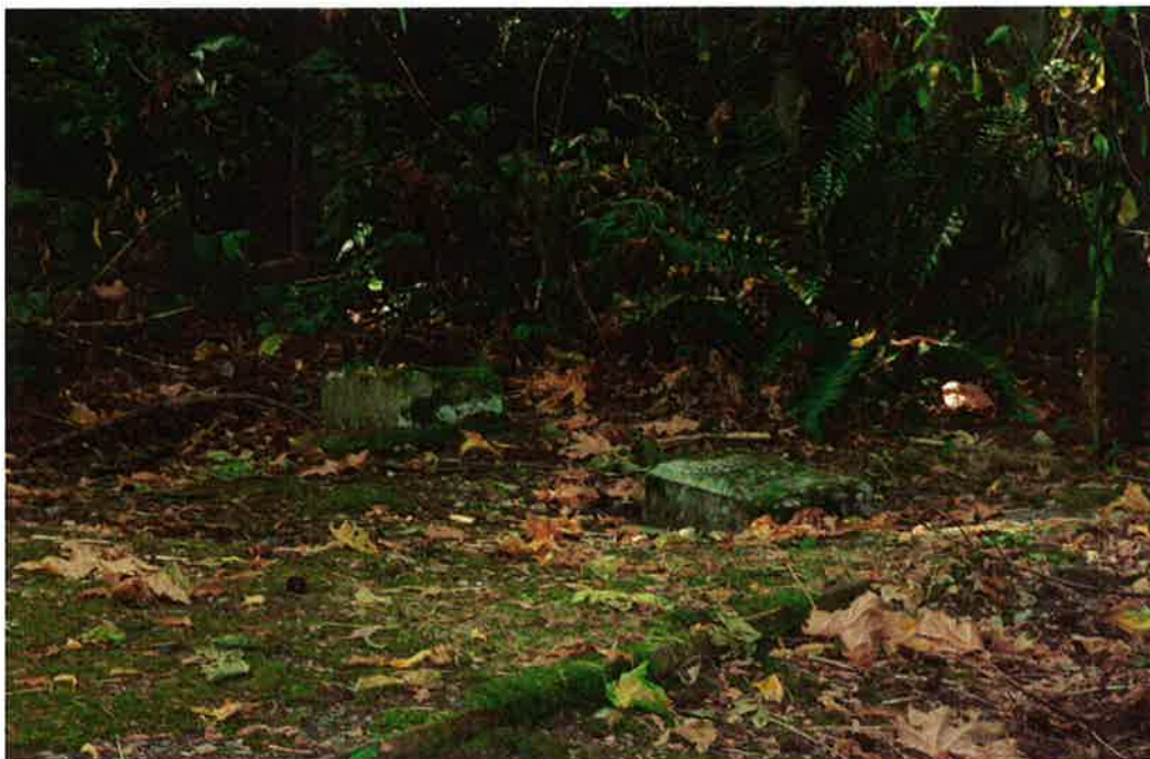
Bothell Swedish Cemetery, Facing south