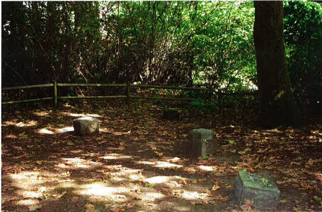
Bothell Swedish Cemetery, Facing north